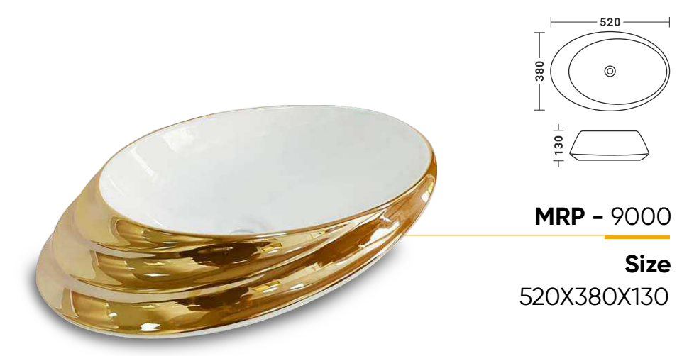
EQTT - 361