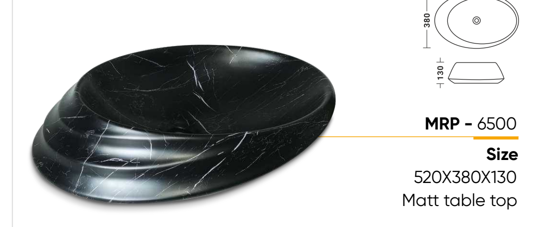
EQTT - 363